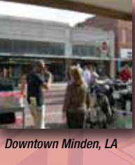
Downtown Minden, LA

When Curtis Plummer (Ice Cube), a down on his luck former high school football star, takes the only job he can find - babysitting his misfit niece Jasmine - he discovers that she has the skills that once made him a great quarterback. The only place these two opposites get along is on the field, so Curtis is determined to turn Jasmine into the star of the local team, The Minden Browns, and get his own stride back by becoming the coach. The boys on the team don't want her but when this girl quarterback shows them she's got the skills, she'll turn their whole world upside down.