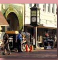
Downtown Minden, LA

The story of Libby Day (Charlize Theron), a woman who at the age of 7, survives the massacre of her family and testifies against her brother as the murderer. Twenty-five years later, a group obsessed with solving notorious crimes confronts her with questions about the horrific event. Told in a series of flashbacks from the points of view of Libby's mother, Patty, and her brother, Ben, Libby is forced to revisit that fateful day and to begin to question what exactly she saw - or didn't see - the night of the tragedy.