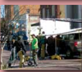
Downtown Minden, LA