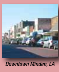
Downtown Minden, LA

Talk-show sensation RJ Stevens (Martin Lawrence) left behind his modest Southern upbringing and family name to transform into a self-help guru. His parents requested he attend their 50th anniversary, so he packs up his son and diva bride-to-be and heads back to Georgia. It's a chance to prove that he's no longer the awkward kid. But when his crazy, lovable family calls him on his big-city attitude and challenges him at every turn, RJ is forced to take a hard look at the man he's become. He may be a superstar in L.A., but he's just one of the guys in Dry Springs.