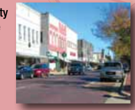
Downtown Minden, LA