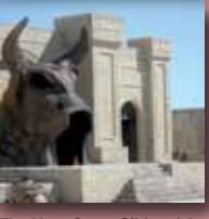
The Year One - Sibley, LA (Set is no longer available)