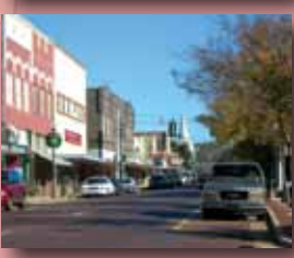
Downtown Minden, LA