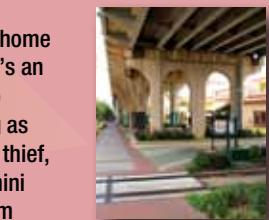
Red River District under the Texas St. Bridge, at Clyde Fant Pkwy, Shreveport