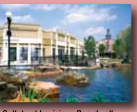
Outlets at Louisiana Boardwalk 540 Boardwalk Blvd., Bossier City

Single father and former cop Tom Carver (Samuel L. Jackson) has an unusual vocation - he cleans up crime scenes. But when he's called in to sterilize a wealthy suburban residence after a brutal shooting, Carver is shocked to learn he may have unknowingly erased crucial evidence, entangling himself in a dirty criminal cover up. Cleaner is a dark, gritty crime thriller that proves cleaning up is the dirtiest job there is.